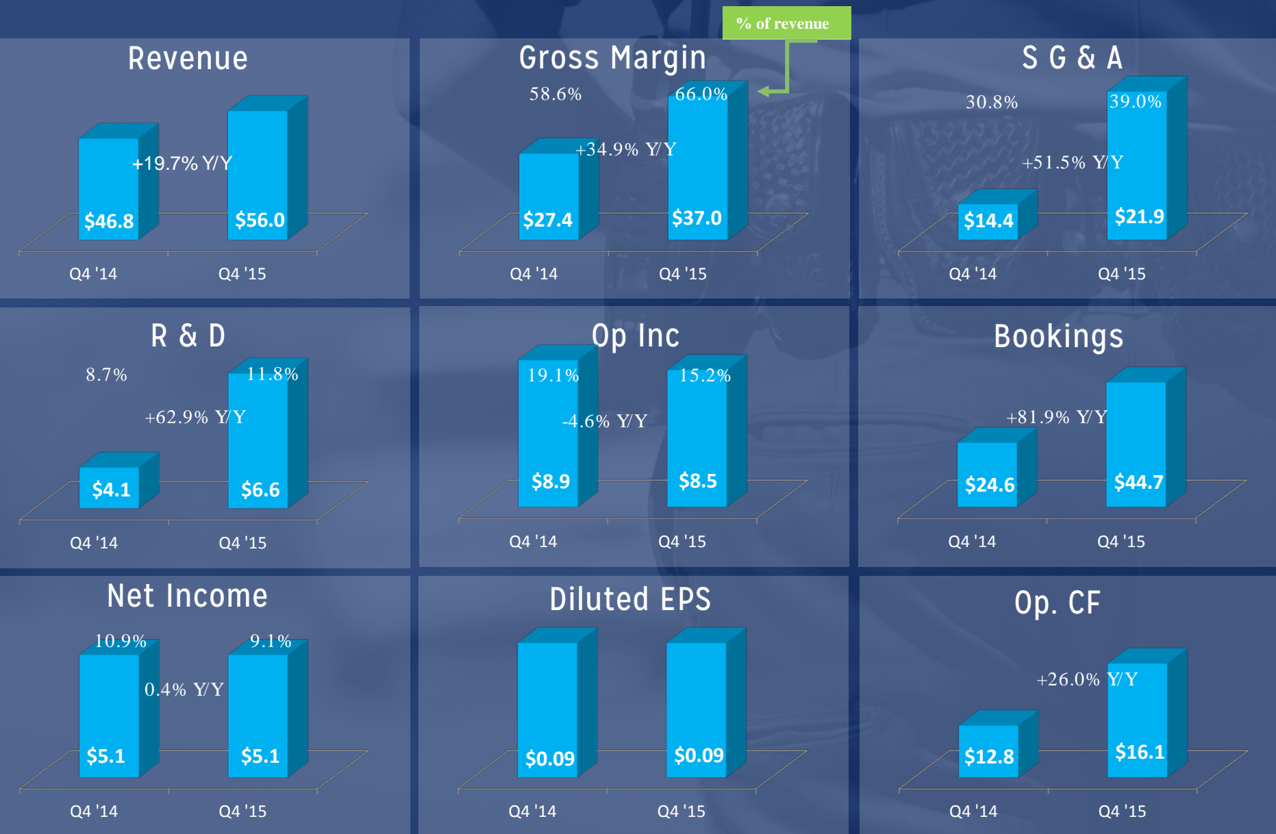
IN MILLIONS, EXCEPT PER SHARE DATA